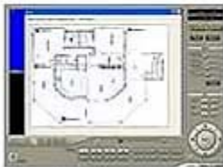
3D eMap Alert on Event