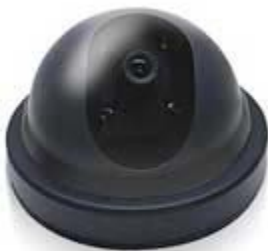
Color Indoor/ Outdoor Dome Type 1/3" CCD image sensor Optical Technology Base 420 Lines Color Horizontal resolution 1 Lux Minimun Illumination