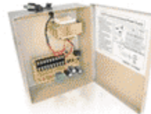
1 x Power Supply