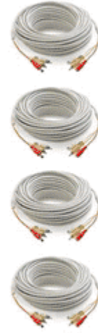
4 x Cable