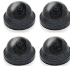
4 x Dome Camera