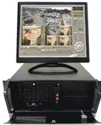
LCD Monitor above is not an actual model